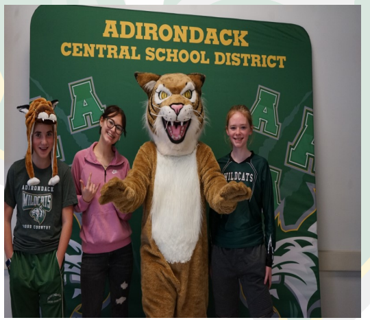
<u>Wildcat Wednesdays</u> 1st Wednesday of Every Month

The state will reimburse Adirondack for approximately 85% of the project.